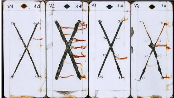
V1 V2 V3 V4

The following picture shows four steel panels without any pre-treatment, coated with: